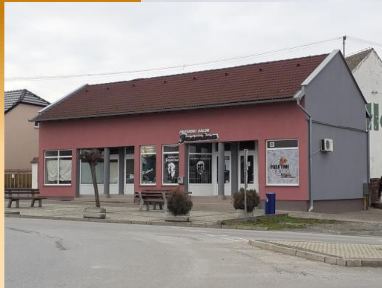
This is the centre of our village, where you can see cafes, supermarkets, a hair salon and fast food restaurants.